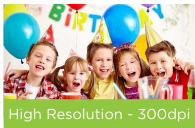
High Resolution - 300dpi

These will give the printer a clear indication on where to trim your artwork.