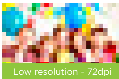
Low resolution - 72dpi